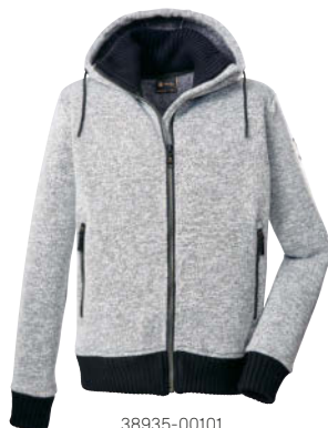
38935-00101 broken white

38935 GW 15 MN KNTFLC JCKT CASUAL KNITTED FLEECE JACKET WITH HOOD MATERIAL Flat Knit Polyester Structure, 100% Polyester SIZE S - XXL