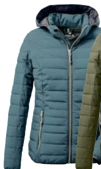
28041-00823 smoke blue