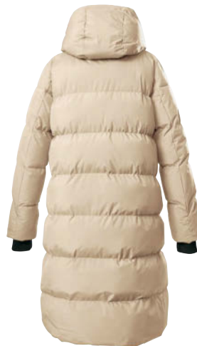
38563-00161 light beige