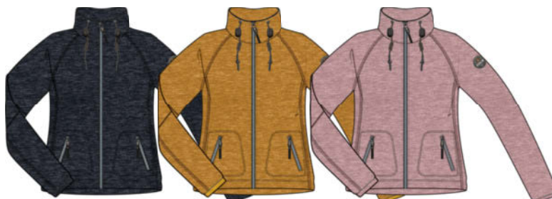
38854-00814 dark navy

38854 GW 23 WMN KNTFLC JCKT CASUAL FLEECE JACKET MATERIAL Fleece Melange bonded, 100% Polyester SIZE 34 - 50