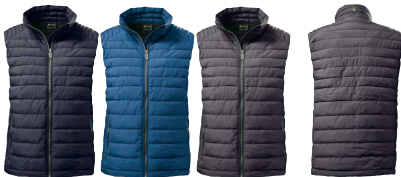
39269-00814 dark navy