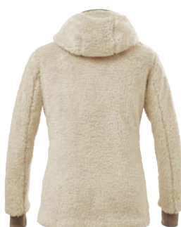
39288-00161 light beige