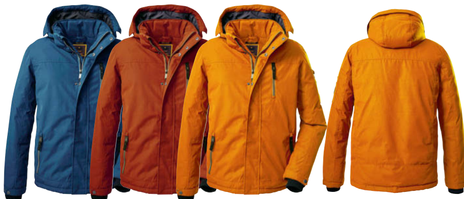
38541-00846 mid blue