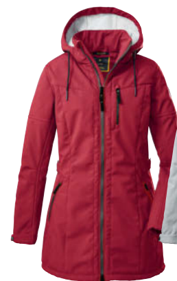
38520-00405 deep red