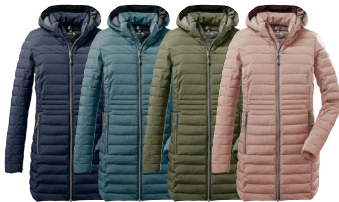
34275-00344 dark navy