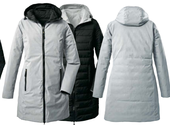
38065-00101 broken white