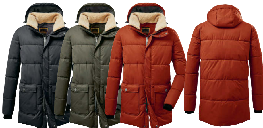
37575-00814 dark navy