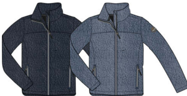
38855-00814 dark navy