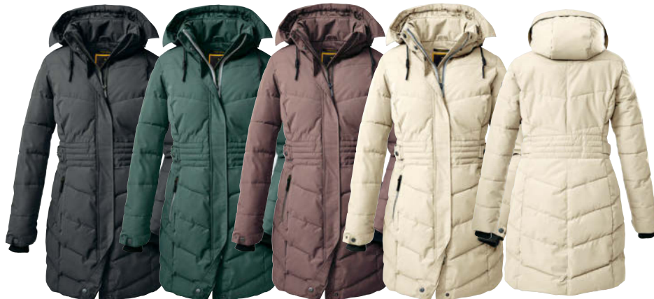
38728-00814 dark navy