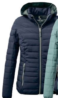
28041-00344 dark navy