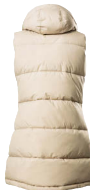
38790-00161 light beige