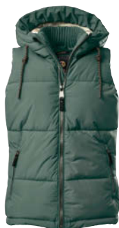
38791-00787 dark tealgreen