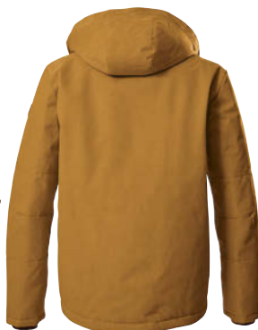
38853-00306 light brown