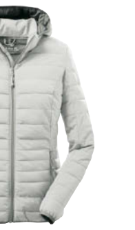
28041-00926 light grey