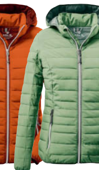
28041-00342 light rust