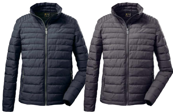
37553-00814 dark navy