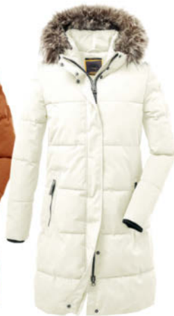
37508-00101 broken white