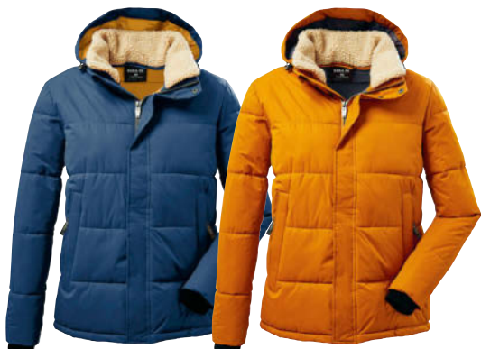
35843-00846 mid blue