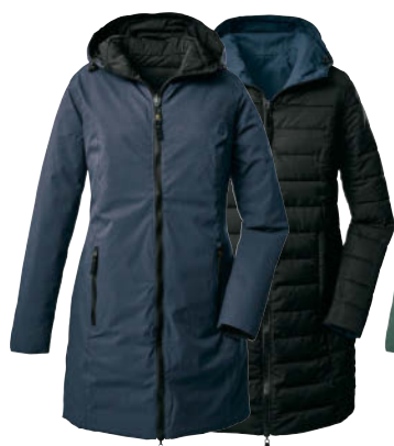
38065-00520 dark blue