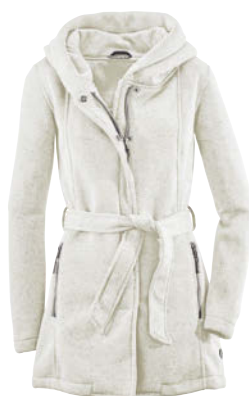
31061-00101 broken white

MATERIALMIX Flat Knit Melange, 100% Polyester, bonded with Antipilling Microfleece, 100% Polyester SIZE 34 - 46