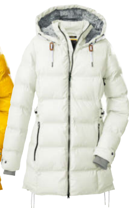
38938-00101 broken white