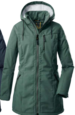
38520-00787 dark tealgreen