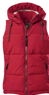
38791-00405 deep red