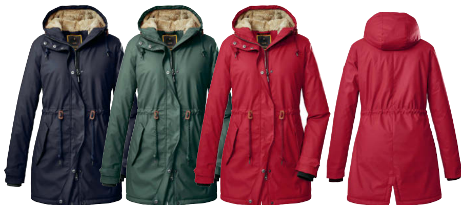
38937-00814 dark navy