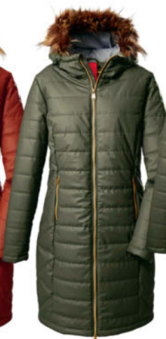
38879-00504 green anthracite