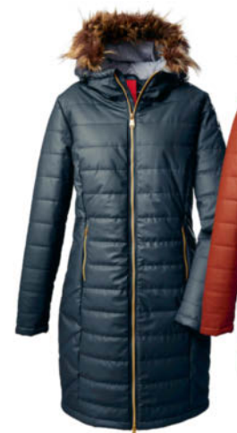
38879-00339 dark navy