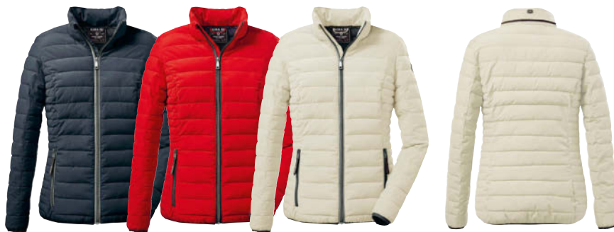
39266-00814 dark navy