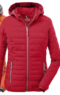
28041-00482 dark apricot