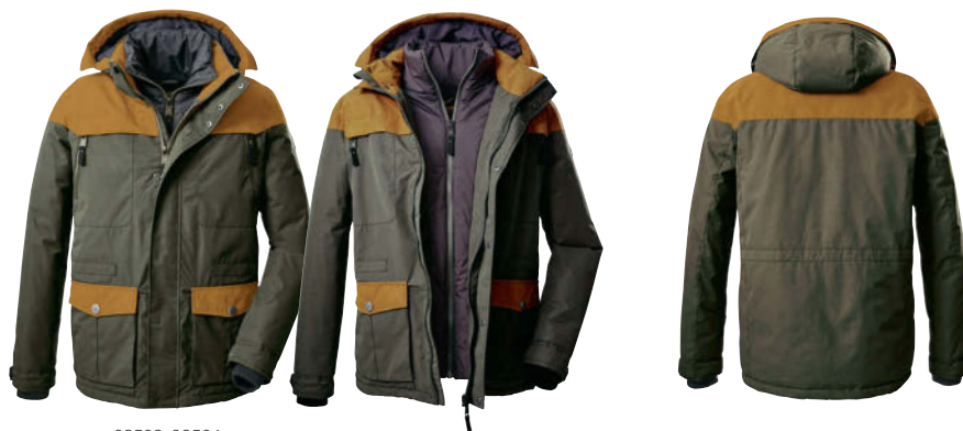
38538-00504 green anthracite