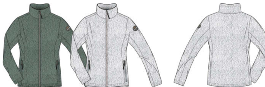
38724-00786 dark mint