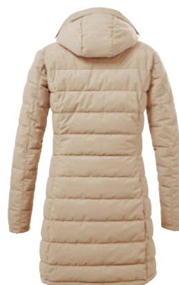
37503-00161 light beige