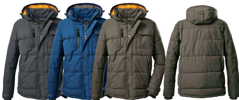
38527-00814 dark navy