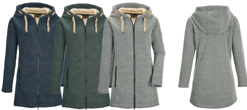
37640-00814 dark navy

MATERIAL Bonded Flat Knit Structure, 80% Polyester, 20% Viscose | Backside Bonded Flat Knit Structure: Sherpa Fleece, 100% Polyester SIZE 34 - 46