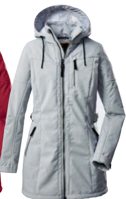
38520-00101 broken white