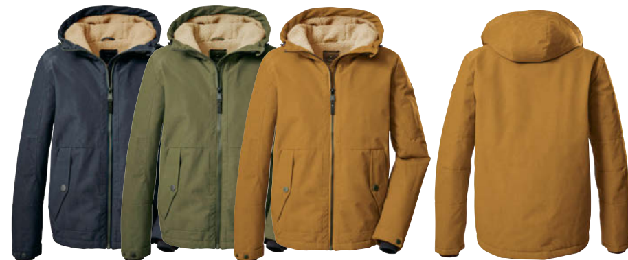
38853-00814 dark navy