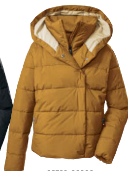
38732-00306 light brown