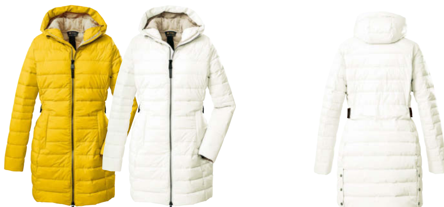
38803-00638 burned yellow