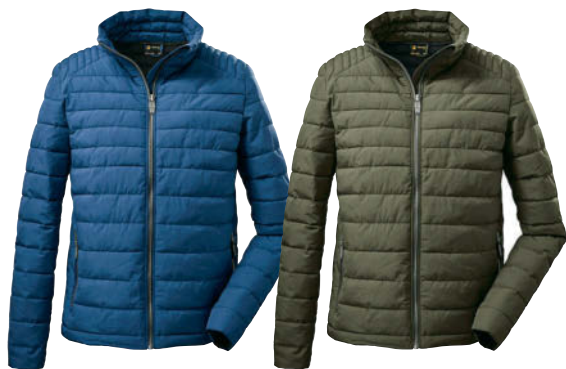
37553-00846 mid blue