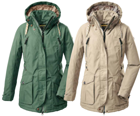
38725-00810 dark mint