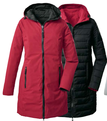
38065-00405 deep red