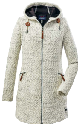
34363-00101 broken white

MATERIALMIX Loop Melange, 70% Polyester, 30% Cotton, bonded with Interlock, 100% Polyester SIZE 34 - 46