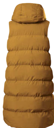
39267-00306 light brown