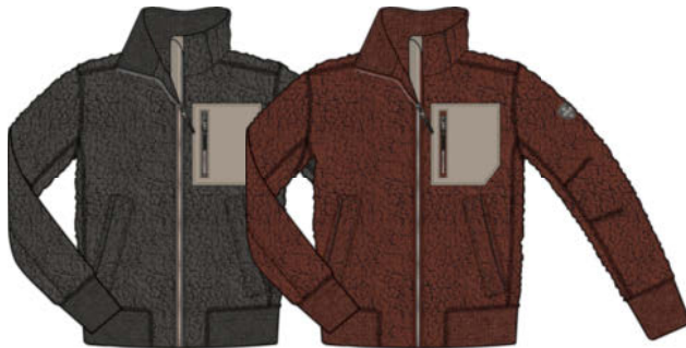
38553-00504 green anthracite

MATERIAL Bonded Sherpa Fleece, 100% Polyester | Backside Bonded Sherpa Fleece: Single Jersey, 100% Polyester SIZE S - XXL