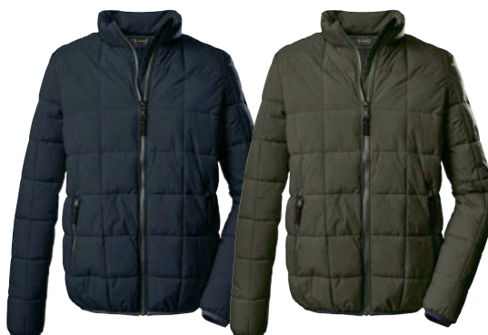
38530-00814 dark navy