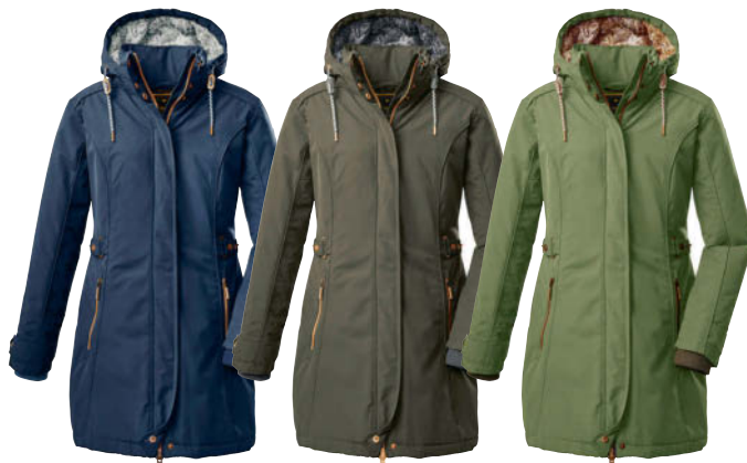
38333-00814 dark navy