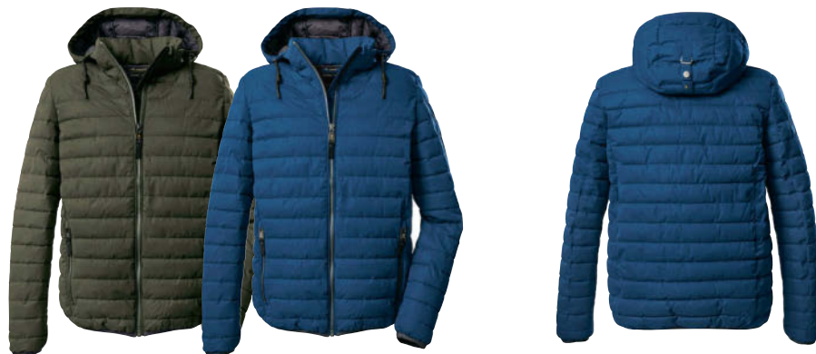
38534-00504 green anthracite