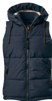
38791-00814 dark navy