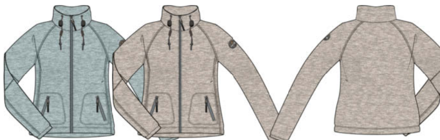
38854-00732 light mint