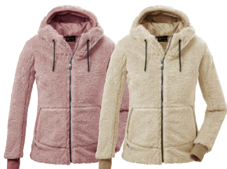
39288-00401 rose wood