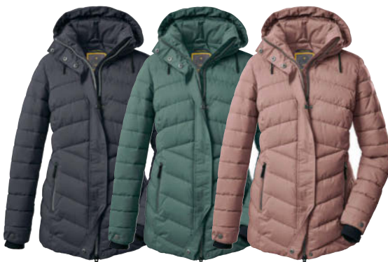
38721-00814 dark navy