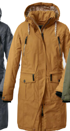
38720-00306 light brown