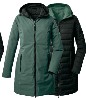
38065-00787 dark tealgreen