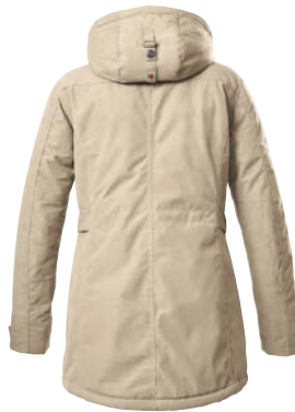
38725-00161 light beige