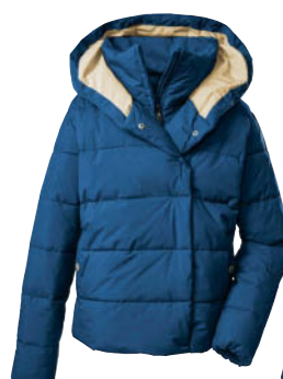
38732-00846 mid blue