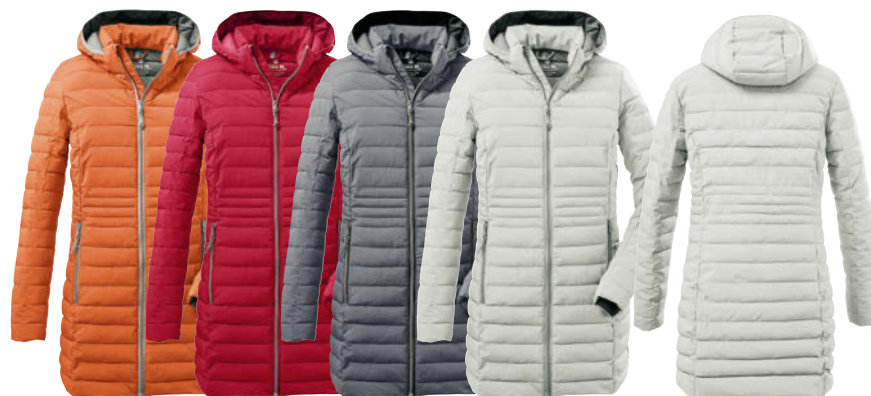
34275-00482 dark apricot