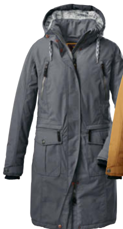
38720-00814 dark navy