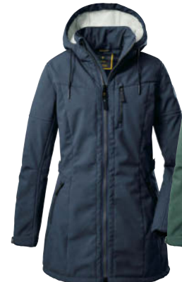
38520-00520 dark blue