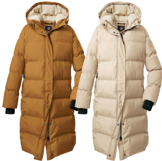
38563-00306 light brown