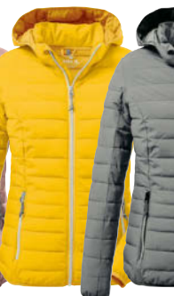
28041-00639 burned yellow