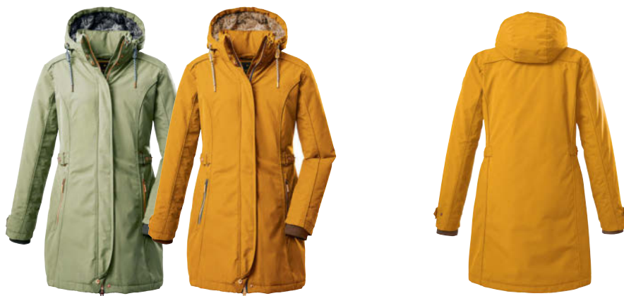
38333-00762 light olive