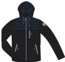
32981-00814 dark navy

Assortment - minimum sale 6 pcs each colour