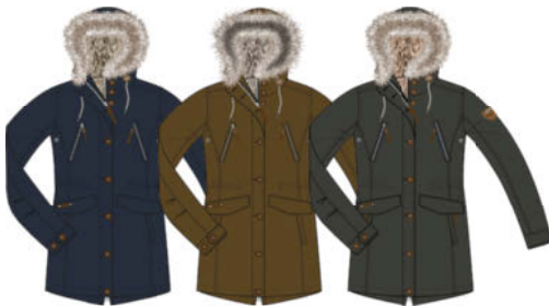
34283-00814 dark navy

Free classification - minimum sale 6 pcs each colour