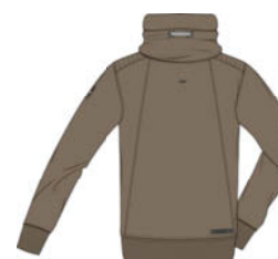
34520-00332 dark sand