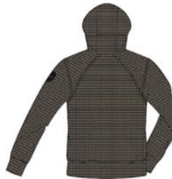
32980-00331 light sand