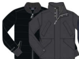
34358-00228 dark grey

Free classification - minimum sale 6 pcs each colour