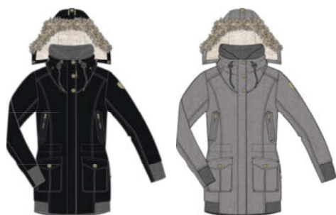
34500-00200 black 34500-00225 mid grey

MATERIAL Colourway 506, 509: Taslon Denim Look, 75% Polyamide, 25% Polyester, PU lamination, water column 8.000 mm Colourway 543, 814: High Peach Polyester, 100% Polyester, PU lamination, water column 8.000 mm LININGMIX Ribstop Taffeta, 100% Polyester | Polyester Taffeta, 100% Polyester | Pilefleece, 100% Polyester SIZE 34 - 54 ITEM NO. 34048 Free classification - minimum sale 6 pcs each colour