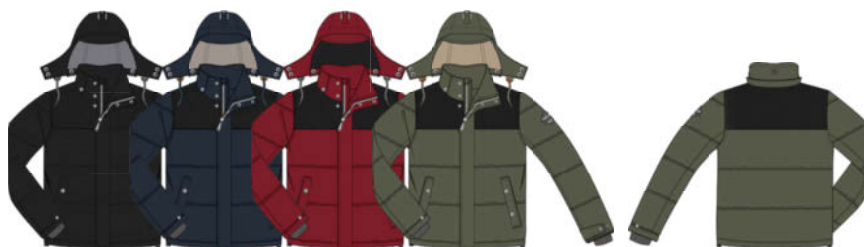
34286-00238 dark anthracite

Free classification - minimum sale 6 pcs each colour