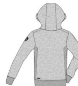
34518-00211 grey melange