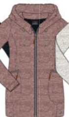
34363-00401 rose wood