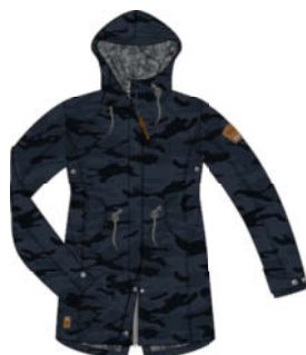
34891-00814 dark navy

Free classification - minimum sale 6 pcs each colour