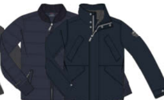
34358-00814 dark navy