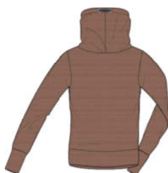
34408-00401 rose wood