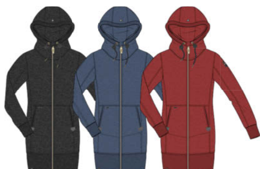
34526-00298 anthracite melange

Free classification - minimum sale 6 pcs each colour