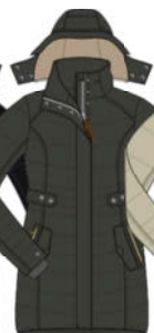
34277-00505 dark olive