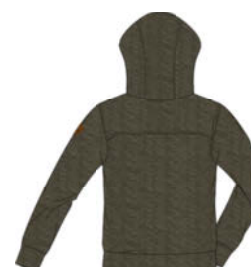
34404-00338 olive brown