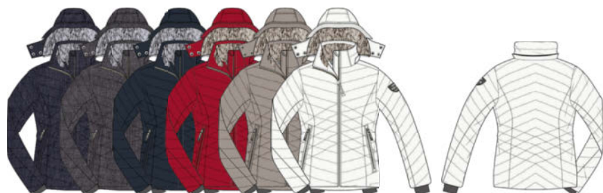
34047-00506 dark denim

Free classification - minimum sale 6 pcs each colour