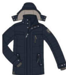
34284-00814 dark navy

Free classification - minimum sale 6 pcs each colour