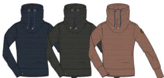
34408-00814 dark navy