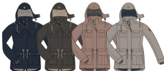
34276-00814 dark navy

Free classification - minimum sale 6 pcs each colour