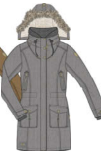
34499-00225 mid grey