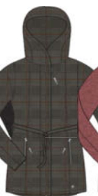
31061-00315 dark brown