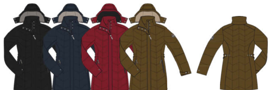
34318-00238 dark anthracite

Free classification - minimum sale 6 pcs each colour