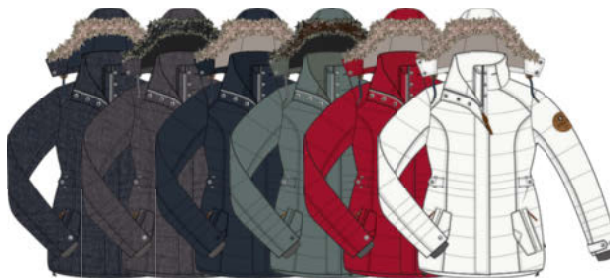
34490-00506 dark denim

MATERIAL Colourway 101, 400, 698, 814: C/N Peached, 43% Cotton, 41% Polyester, 16% Polyamide, PU lamination, water column 8.000 mm Colourway 506, 509: Taslon Denim Look, 75% Polyamide, 25% Polyester, PU lamination, water column 8.000 mm LININGMIX Ribstop Taffeta, 100% Polyester | Polyester Taffeta, 100% Polyester SIZE 34-50 ITEM NO. 34490 Free classification - minimum sale 6 pcs each colour