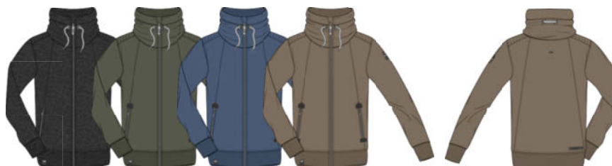
34520-00298 anthracite melange

Free classification - minimum sale 6 pcs each colour