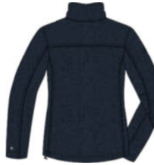
34416-00814 dark navy