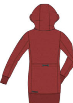
34526-00408 dark red