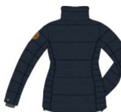
34273-00814 dark navy