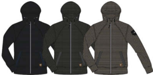
32980-00814 dark navy