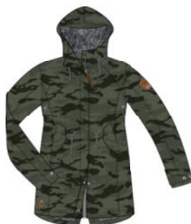
34891-00338 olive brown