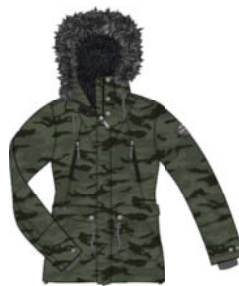
34279-00338 olive brown