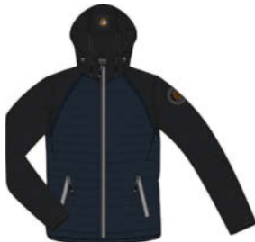
32979-00814 dark navy

Assortment - minimum sale 6 pcs each colour