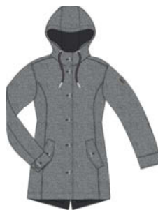
31161-00225 mid grey