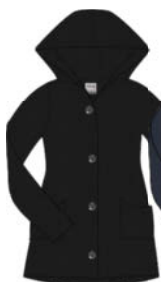
33049-00238 dark anthracite

Free classification - minimum sale 6 pcs each colour