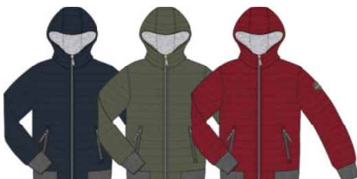
34295-00814 dark navy

Free classification - minimum sale 6 pcs each colour