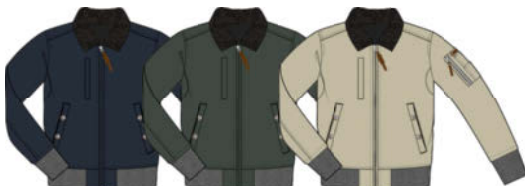
34290-00814 dark navy

Free classification - minimum sale 6 pcs each colour