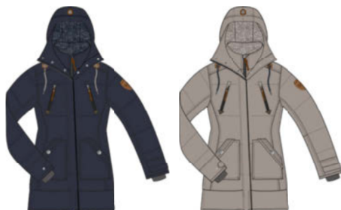
34572-00880 navy 34572-00134 champagne

MATERIAL Taslon Denim Look, 75% Polyamide, 25% Polyester, PU lamination, water column 8.000 mm LININGMIX Ribstop Taffeta, 100% Polyester | Polyester Taffeta, 100% Polyester | Teddyfleece, 100% Polyester SIZE 36 - 50 ITEM NO. 30735 Free classification - minimum sale 6 pcs each colour