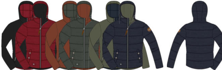
34362-00455 dark red

Free classification - minimum sale 6 pcs each colour