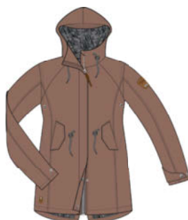
34281-00401 rose wood