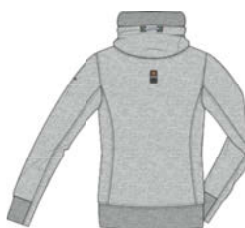
34522-00211 grey melange