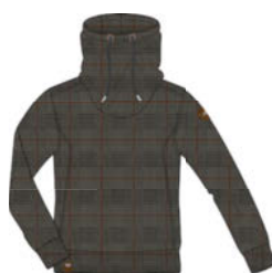
34405-00315 dark brown

Free classification - minimum sale 6 pcs each colour