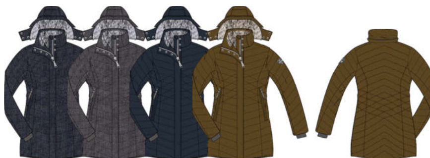
34048-00506 dark denim 34048-00509 denim anthracite 34048-00814 dark navy 34048-00543 bronze