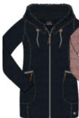
34363-00814 dark navy

Free classification - minimum sale 6 pcs each colour