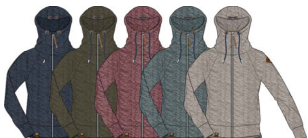
34410-00814 dark navy

Free classification - minimum sale 6 pcs each colour