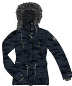
34279-00814 dark navy

MATERIAL Full Dull Polyester Camouflage Print, PU lamination, water column 8.000 mm LININGMIX Ribstop Taffeta, 100% Polyester | Polyester Taffeta, 100% Polyester | Teddyfleece, 100% Polyester SIZE 34-46 ITEM NO. 34279 Free classification - minimum sale 6 pcs each colour