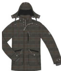
34287-00315 dark brown

Free classification - minimum sale 6 pcs each colour