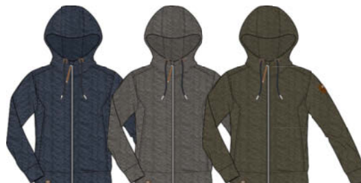
34404-00814 dark navy

Free classification - minimum sale 6 pcs each colour