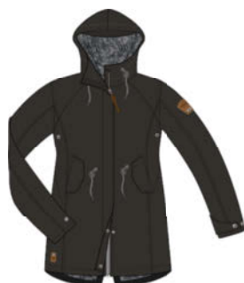
34281-00238 dark anthracite

Free classification - minimum sale 6 pcs each colour