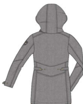
34506-00225 mid grey