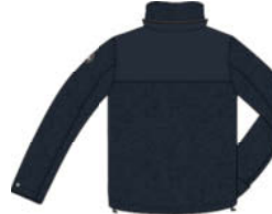
34291-00814 dark navy