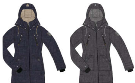
30735-00506 dark denim 30735-00509 denim anthracite

MATERIAL Colourway 200: Full Dull Twill, 88% Polyester, 12% Polyamide, PU lamination, water column 8.000 mm Colourway 225: Oxford Melange, 100% Polyester, PU lamination, water column 8.000 mm LININGMIX Ribstop Taffeta, 100% Polyester | Polyester Taffeta, 100% Polyester | Tex Teddyfleece, 100% Polyester SIZE 34 - 46 ITEM NO. 34500 Free classification - minimum sale 6 pcs each colour