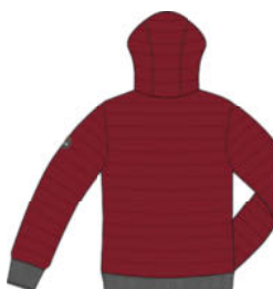
34295-00455 dark red