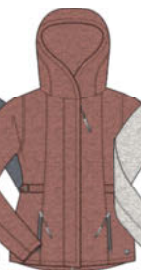
34323-00424 dark rose